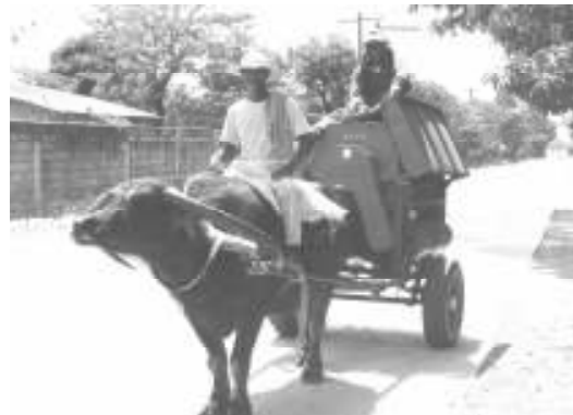
High-tech Cows? A carabao, a true beast of burden, and the Philippine's national animal, dutifully pulls a rice thresher to another field during the rice harvest .

It's the dry season again, so there isn't much hope of rain cooling things down any time soon. The days, sizzling beyond 100 degrees, have everyone scrambling for shade and cold drinks. Sometimes it gets pretty unbearable, but the Lord's grace is sufficient. During these scorching times things tend to slow down at mid-day while everyone waits for the heat to break; And the coolness of the